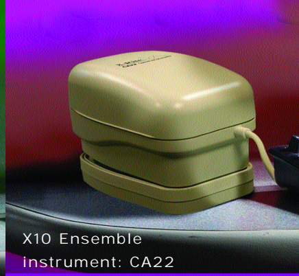
X10 Ensemble instrument: CA22