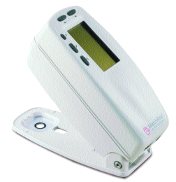
Optional add-on instrument: Portable spectrophotometer