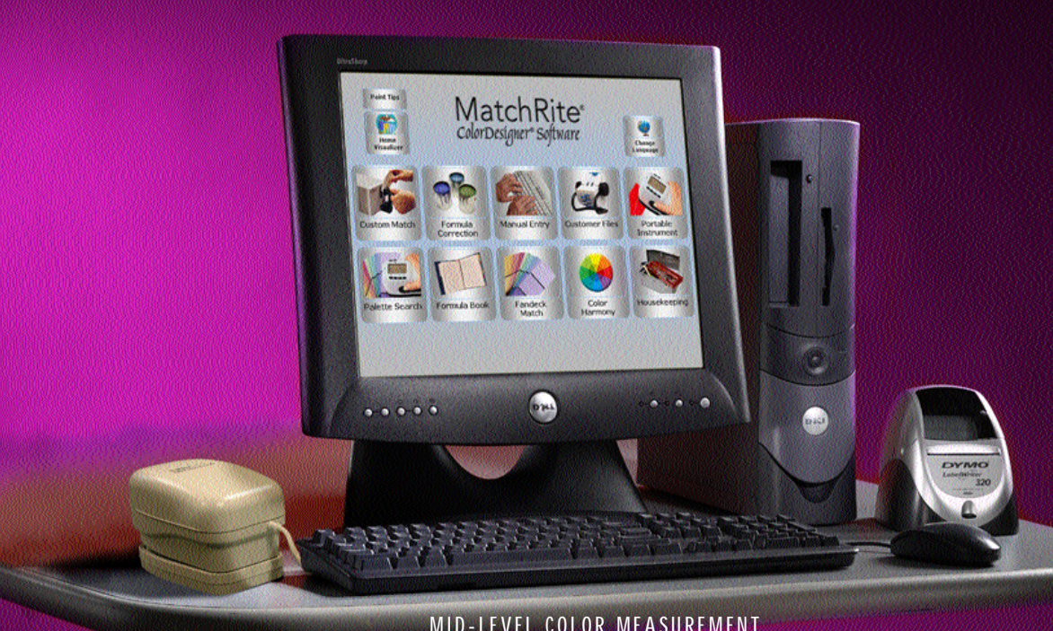
MID-LEVEL COLOR MEASUREMENT