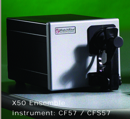
X50 Ensemble instrument: CF57 / CFS57